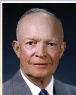
Dwight D. Eisenhower